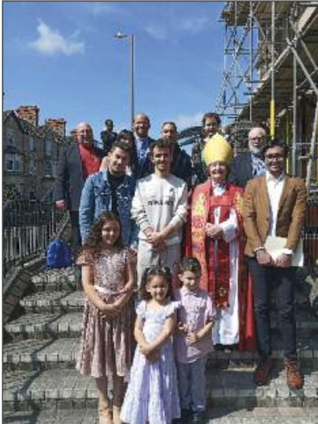
Partnership Confirmation at Bath Road Methodist Church Sunday 8th May 2022