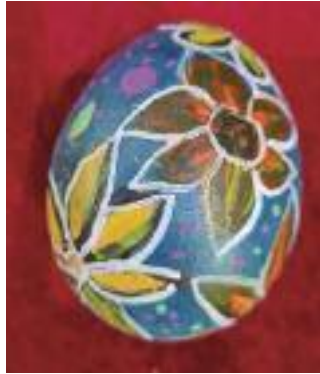
Winner of the adult competition Adeline